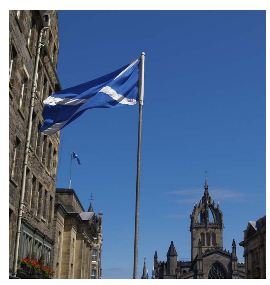
reasonably be done but this is the first case where it has been.

Comment: Unlike England and Wales, Scotland does not have a legal framework for periodical payments. Periodical payments may however be made by agreement between the parties. The Scottish Government encourages public authorities to settle catastrophic injury claims on this basis where it can